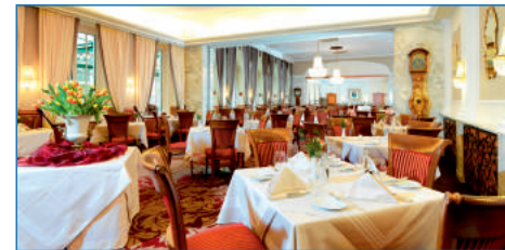
The ballroom of the Hotel Stefanie in Vienna

Cost: 60,- €/person (incl. buffet, without drinks), registration required