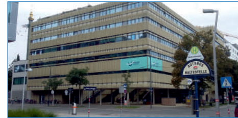
Sigmund Freud University Vienna

free of charge, no registration required