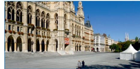
The historic City Hall of the City of Vienna